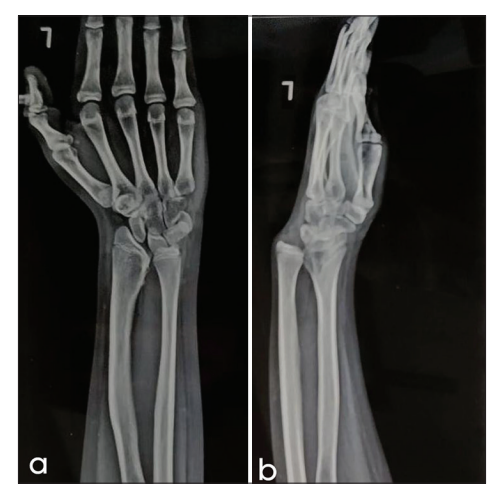
Figure 1: (a) Frontal and (b) lateral radiographs of the left hand demonstrate Madelung deformity with positive ulnar variance. There is lunate subsidence and wedge-shaped proximal carpal row. Dorsal subluxation of the ulnar head is causing "bayonet" like deformity.

A radial notch at the attachment site of the Vickers ligament and the presence of this anomalous radiolunate ligament can help differentiate Madelung-type deformities from true congenital Madelung deformities.<sup>[5]</sup> Various conditions can produce a Madelung-like or pseudo-Madelung deformity; however, they lack the characteristic Vickers ligament or the anomalous radiotriquetral ligaments seen in true Madelung deformity [Table 1]. MRI is the preferred imaging modality