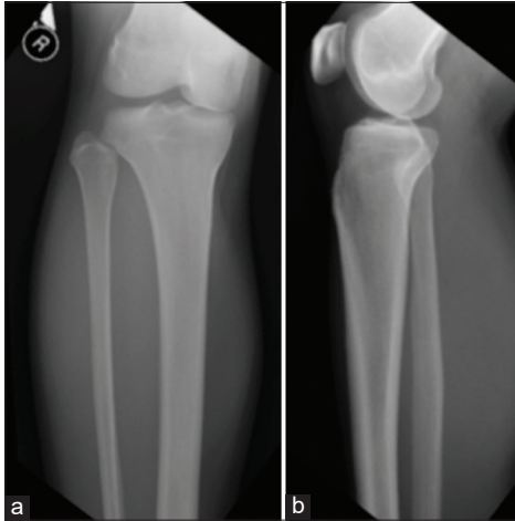
Figure 1: AP and lateral radiograph of knee does not show any calcification in the pretibial region.