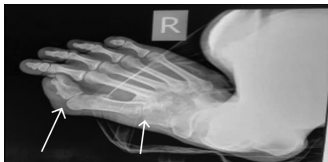
Figure 5: X-ray of foot shows hallux valgus deformity with microdactyly due to short broad proximal phalanx and absent distal phalanx and there is synostosis of the metatarsal bases with tarsal bones.

In our patient, due to delayed presentation with fixed deformities, only symptomatic treatment was offered for the recent trauma. Routine clinical assessment and follow-up of the patient with the aim of rehabilitation and improved quality of life was provided. Further, preventive measures and lifestyle modifications with a view to reduce future injuries to the patient were also advised.