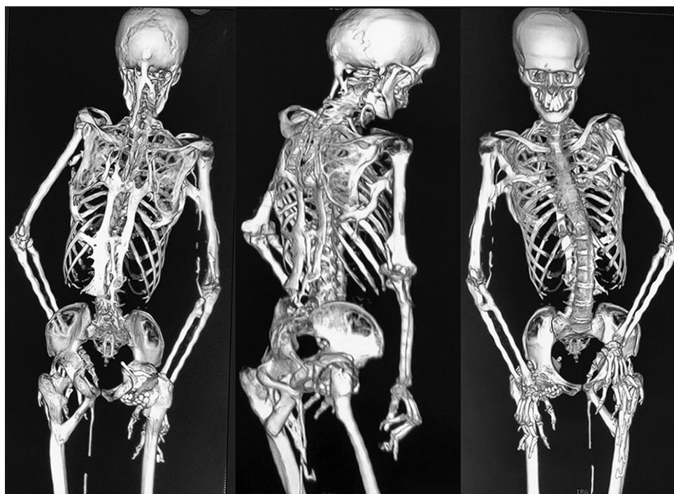
Figure 6: The 3D-reconstructed computed tomography scan in posterior, oblique and anterior view reveals the extent of heterotopic ossification from occiput to femoropelvic junction.

FOP is a very rare disease and chances of misdiagnosis are very high due to the similarity with patterns of various diseases such as arthritis, rheumatic diseases, and soft-tissue sarcomas, leading to improper management of the cases. [6,9] FOP is generally diagnosed on clinical grounds based on the presence of its hallmark features of congenital anomalies of