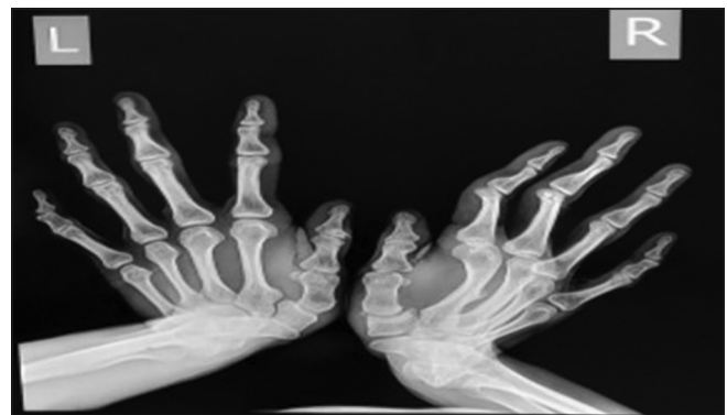
Figure 4: X-ray of both hands shows microdactyly of both thumbs with fused bilateral wrist joints. The metacarpals of both hands appear short and broad with asymmetrically pronounced shortening of 1 st metacarpal of bilateral hands.