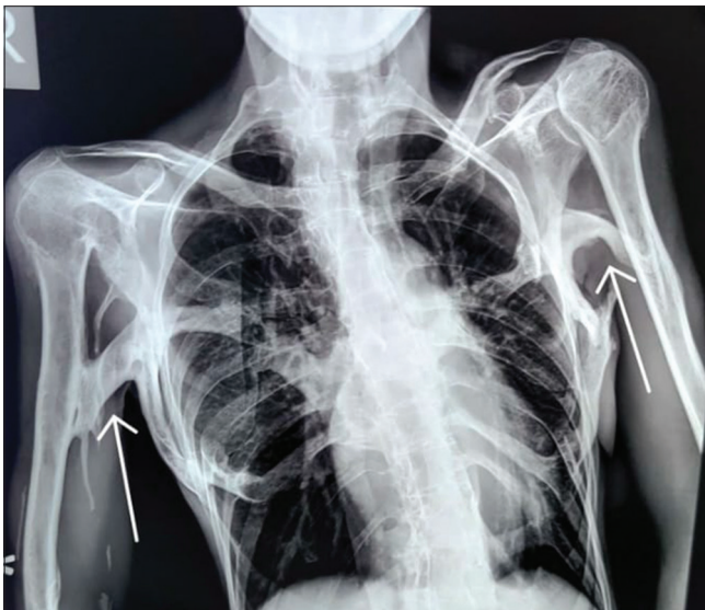
Figure 2: Chest X-ray (PA view) shows thick bands of heterotopic ossification resulting in bridging of rib cage to humerus on either side and limiting lateral arm mobility.

showed broad femoral necks with thick bands of ossification extending from the left pubic bone to mid femoral shaft, along with soft-tissue ossification along the medial aspect of the thigh and left peritrochanteric region. In addition, there were multiple osteochondral bodies and associated osteoarthritic changes along the deformed and remodeled right hip with periarticular osseous ankylosis [Figure 3]. A radiograph of both hands showed microdactyly of both thumbs with fused bilateral wrist joints. The metacarpals of both hands appeared short and broad with asymmetric pronounced shortening of the 1 st metacarpal bilaterally [Figure 4]. A radiograph of the right foot showed hallux valgus deformity with microdactyly due to a short broad proximal phalanx and absent distal phalanx of the great toe. There was also synostosis of the metatarsal bases with tarsal bones [Figure 5]. 3D-reconstructed CT scan in anterior, oblique, and posterior views [Figure 6] revealed the extent of heterotopic ossification from occiput to femoropelvic