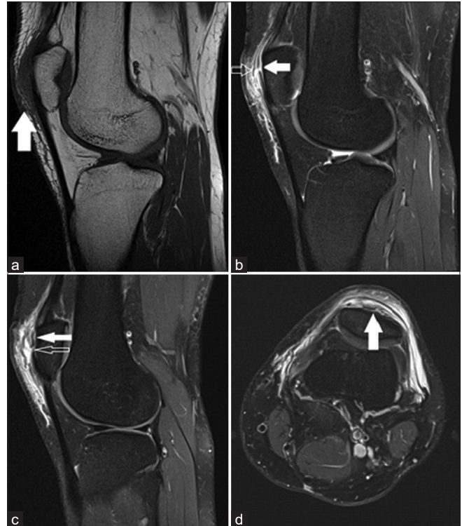
Figure 2: (a) Sagittal T1-weighted and (b and c) sagittal and (d) axial proton-density fat-saturated sequences of the left knee demonstrating prepatellar soft-tissue swelling of T1-weighted intermediate-to-hypointense signal (a – solid arrow). Disruption of the superior prepatellar quadriceps continuation fibers (b – solid arrow) and overlying fascial layers (b – open arrow) with associated surrounding high signal on proton-density fat-saturated sequences consistent with partial tearing and edema. There is stripping of the superior prepatellar quadriceps continuation from the anterior patellar surface (c and d – solid arrow) with associated tear (c – open arrow).

Following orthopedic review, the patient was managed with an adjustable range of motion knee brace, initially allowing