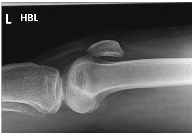
Figure 1: Lateral radiograph of the left knee demonstrating prepatellar soft-tissue swelling but no bony injury, effusion, or lipohaemarthrosis. HBL: Horizontal beam lateral.

MRI revealed an injury to the prepatellar quadriceps continuation, causing the structure to elevate off the anterior patellar cortex, with stripping and partial tearing of the superior fibers [Figures 2 and 3]. Fluid was present in the prepatellar subcutaneous fat as well as between the prepatellar fascial layers, signifying traumatic bursitis [Figures 2 and 3]. Of note, there was no bone marrow edema or discrete fracture of the patella. There was no retraction of either the quadriceps or patellar tendon fibers. There was also no other bony or soft tissue injury identified elsewhere.