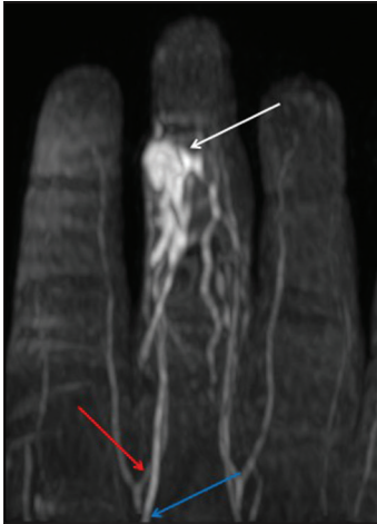
Figure 5: A 27-year-old woman with an arteriovenous fistula of the digit presented with swelling over her left middle finger. Dynamic magnetic resonance angiography MIP image shows the lesion (white arrow) with an arterial feeder (red arrow) from the radial branch of the proper digital artery of the middle finger. There is an early draining vein (blue arrow). MIP: Maximum intensity projection.

during procedures where there are chances of damage to the adjacent vessels. These injuries are also common in IV drug abusers. In the western countries, gunshot injuries are the common cause of penetrating vascular injuries. Needle injuries are mostly accidental and are seen commonly in healthcare workers.