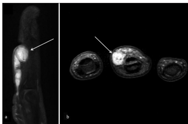
Figure 4: A 27 year old woman with an arteriovenous fistula of the digit presented with swelling over her left middle finger. MRI of the finger in the short tau inversion recovery sequence shows: (a) A well defined hyperintense lobulated round lesion (arrow) with a serpiginous proximal extension, (b) the lesion (arrow) is separate from the flexor tendon, located eccentrically towards the radial aspect of the finger.