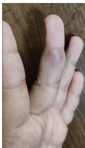
Figure 1: A 27 year old woman presented with a swelling over her left middle finger. The swelling is reddish with a smooth overlying skin.

A magnetic resonance imaging (MRI) of the finger showed a well-defined 7 \times 10 \times 20 mm round lobulated lesion in the subcutaneous plane along the radial aspect of the middle finger at the region of the middle phalanx. There was a serpiginous extension proximally up to the proximal interphalangeal joint. It was hyperintense on short-tau inversion recovery, hypointense on T1 sequences. Fat planes were maintained with the flexor tendon and the collateral ligaments [Figure 4]. On dynamic imaging, there was early arterial phase enhancement