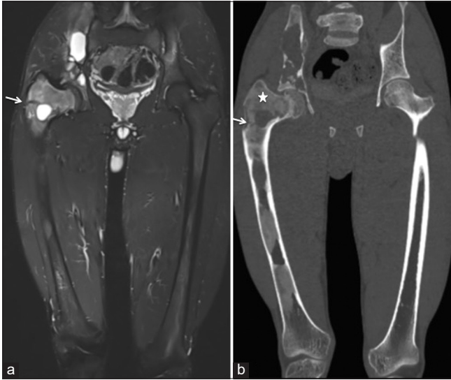
Figure 2: (a) Coronal PDFS magnetic resonance imaging of hip joints, femur, and proximal knee joints showed the extent of involvement of the right innominate bone and right femur. A hypointense line was seen in the neck of the femur (solid white arrow), suspicious of fracture. (b) Corresponding coronal maximum intensity projection (MIP) computed tomography scan image (b) showed the classical ground glass matrix of fibrous dysplasia (star) and interspersed lytic lesions. A hypodense minimally displaced fracture line was seen in the neck of the femur (White arrow).