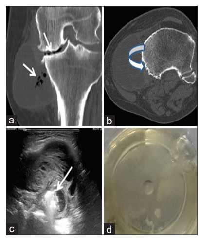
Figure 3: (a,b) Coronal and axial computed tomography images showing tibial cortical erosion (curved arrow), air foci within the lesion, and medial joint space. (c) Ultrasound showing the complex nature of the cyst as thick septations and air pockets (arrow) within it. (d) Ultrasound-guided aspirate from the lesion showing clear yellowish gelatinous material.