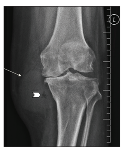
Figure 1: Plain radiograph of the left knee joint showing a welldefined radio-opacity (arrow) along the medial border of the joint and proximal tibia with few air foci within it (arrowhead). Note the degenerative changes in the joint, predominantly in the medial compartment.

and with radiographic features of soft-tissue lesion, magnetic resonance imaging (MRI) was performed for further evaluation.