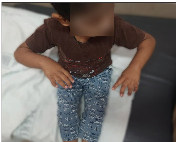
Figure 2: Clinical photograph showing full pronation possible only after compensatory internal rotation at shoulder.