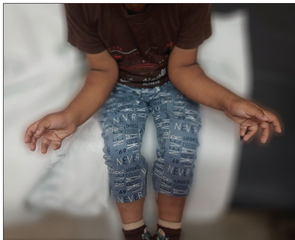
Figure 1: Clinical photograph showing restricted supination bilaterally with further supination possible only after compensatory external rotation at shoulder.

Plain radiographs in anteroposterior and lateral views revealed radioulnar synostosis at both elbows of 5 cm on each side [Figures 3 and 4].