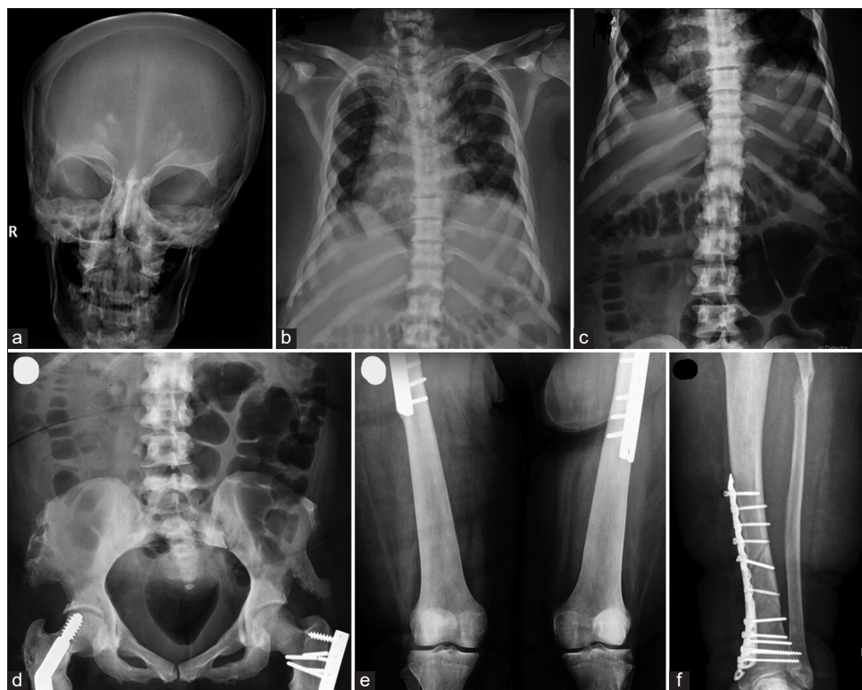
Figure 1: (a) Skeletal survey showing increased bone density and thickened calvarium of the skull with bilateral basal ganglia calcifications. (b & c) The spine showing increased bone density and multiple old rib fractures with callus formation. (d) Pelvis and hip joints showing increased bone density, bony exostosis, and bilateral femoral neck old fractures with metallic fixation. (e) Distal femurs and knee joints showing increased bone density with metallic fixation of proximal femoral shaft fractures. (f) The left leg showing both bones of lower limb fractures with metallic fixation of the distal tibia.

The diagnosis of carbonic anhydrase II deficiency was made as the patient had osteopetrosis, RTA, and cerebral calcification. She was managed with intravenous potassium chloride and was discharged on oral potassium chloride with sodium bicarbonate supplementation. The family refused for genetic studies.