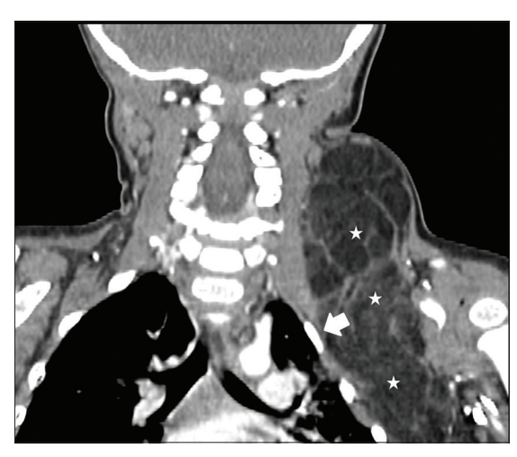
Figure 4: Contrast-enhanced computed tomography coronal section of neck and thorax depicts a fat attenuation mass (asterisks) in the posterior triangle of neck extending into the axilla on the left side causing mass effect over the left side of thoracic cavity (arrow).

Since it is a tumor of embryonal white fat, histologically cells range in differentiation from prelipoblasts to mature lipocytes interspersed in a myxoid stroma.[3] These tumors are locally aggressive; however, metastasis is not known to occur.