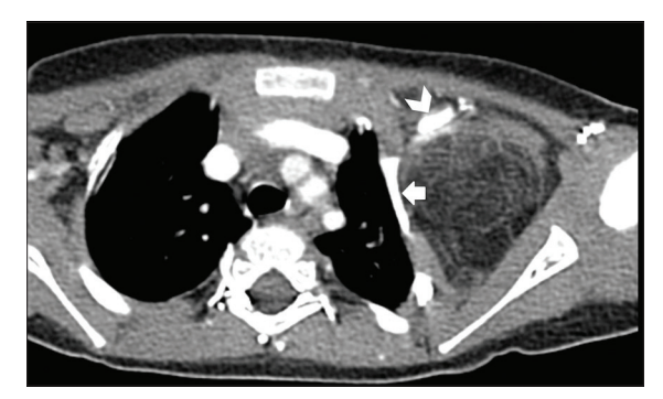
Figure 3: Contrast-enhanced computed tomography axial section of thorax at the level of root of great vessels depicts mass effect of the mass over the rib cage (arrow) displacing it medially. Subclavian vessels (arrowhead) seen to drape the mass anteriorly.

Lipoblastoma is a rare mesenchymal soft tissue tumor of early childhood,[1] (<3 years) of age with predilection for male infants.[2] The tumor is benign in nature, however, may be locally invasive or progressive. Lipoblastoma term is used when it is well-defined and encapsulated, as in our case whereas when diffusely infiltrative, it is called lipoblastomatosis. The former is seen in subcutaneous region whereas the latter affects the underlying muscles as well. Lipoblastoma is commoner than lipoblastomatosis, occurring most commonly in the extremities (70% cases) followed by chest and head and neck region.<sup>[2]</sup>