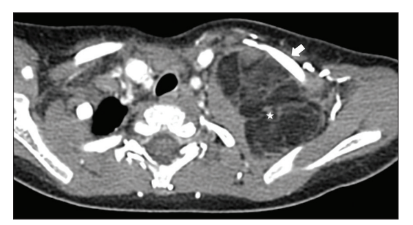
Figure 2: Contrast-enhanced computed tomography axial section at the level of thoracic inlet depicts extension of mass (asterisk) into the axilla causing anterior displacement of the clavicle (arrow).

causing anteromedial displacement of internal jugular vein and common carotid artery. The left subclavian artery is seen to drape around the mass. However, fat planes with the vessels and adjacent structures are well maintained. Imaging findings were characteristic of lipoblastoma. The child was managed surgically and the tumor was resected completely.