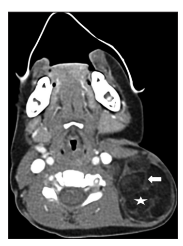
Figure 1: Contrast-enhanced computed tomography axial section of neck depicts a well-defined fat-attenuation mass (asterisk) in the posterior triangle on the left side of neck having multiple thin enhancing septations (arrow) within. Arrow shows thin enhancing septa, asterisk shows fat component.