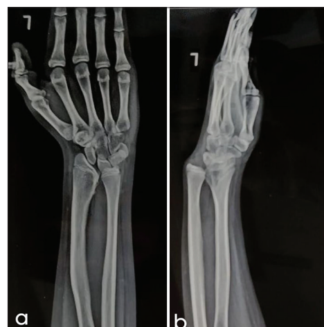
Figure 1: (a) Frontal and (b) lateral radiographs of the left hand demonstrate Madelung deformity with positive ulnar variance. There is lunate subsidence and wedge-shaped proximal carpal row. Dorsal subluxation of the ulnar head is causing “bayonet” like deformity.

A radial notch at the attachment site of the Vickers ligament and the presence of this anomalous radiolunate ligament can help differentiate Madelung-type deformities from true congenital Madelung deformities. [5] Various conditions can produce a Madelung-like or pseudo-Madelung deformity; however, they lack the characteristic Vickers ligament or the anomalous radiotriquetral ligaments seen in true Madelung deformity [Table 1]. MRI is the preferred imaging modality