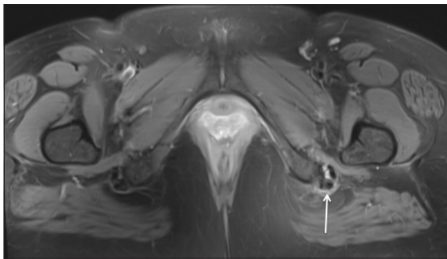
Figure 3: PDFS axial demonstrating edema in relation to the left hamstrings (arrow).

to maintain tension and as such allow for hypermobility within the joint, degeneration of joint spaces may also lead to hypomobility. [18] In both instances, this may be experienced as pain. Sacroiliac joint pain may be challenging to diagnose due to its array of presentations in regions surrounding the pelvis. [18]