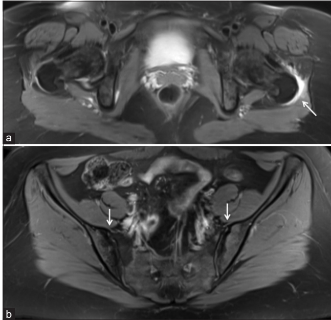
Figure 2: PDFS axial demonstrating edema in relation to the left trochanteric bursitis (arrow) (a) and bilateral chronic sacroilitis (arrow) (b).