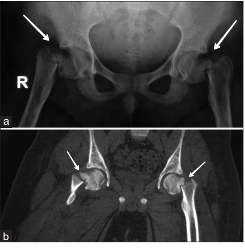
Figure 1: (a) Radiograph of the pelvis with both hip joints, the frontal projection shows complete and displaced fracture of the neck of both femora (arrows), consistent with Delbet type II. (b) Computed tomography scan of the pelvis with both hip joints in coronal acquisition depicts the same findings (arrows) as in radiography.

Hypocalcemia was corrected with parenteral calcium gluconate, followed by oral calcium supplements. After normalization of serum calcium, open reduction, and internal fixation were performed for both fractures and thereby both hip joints were stabilized. An additional subtrochanteric valgus osteotomy [Figure 2]; was planned on two sittings, over 6 weeks. The postoperative period was uneventful. Oral calcium and vitamin D supplementation was given for the next 3 months. Restriction to activities like weight-bearing/lifting was advised, followed by adequate physiotherapy comprising isometric quadriceps exercises and passive range exercises of both hip joints for a couple of