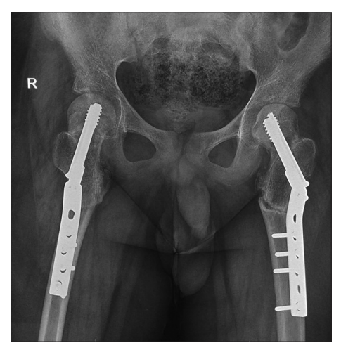
Figure 2: Radiograph of the pelvis with both hip joints. Post-operative status. Fixation screws in situ stabilizing both hip joints. Joint spaces and subjacent soft-tissue shadows appear normal.

months. At a subsequent follow-up visit in the 9<sup>th</sup> month, the patient ambulated independently, yielding a full and painless range of movements of both hip joints.